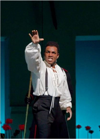
Lawrence Brownlee in Armida at the Metropolitan Opera